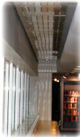
RC Quick Overview