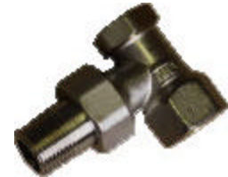
Valve-ANG Angle Shut Off Valve