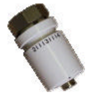
White Thermostat Control Sensor