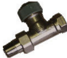
Control-ST Straight Control Valve

These nickel plated control valves combined with the control sensor provide thermostatic control at the radiator. They are available in straight, angle, or reverse angle configurations in both 1/2" or 3/4" sizes (male threaded union X female threaded connections).