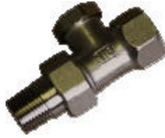
Valve-ST Straight Shut Off Valve

These valves are nickel plated combination shutoff/unions, suitable for exposed installation or installation behind full covers. The valves are available in either a straight pattern or angle pattern in 1/2" or 3/4" sizes (male threaded union X female threaded connections).