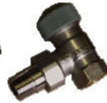
Control-ANG Angle Control Valve