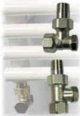
SHUT-OFF VALVES Shut-off valves allow the advantage of isolating the units from the rest of the system .

All valves come in two configurations -- angled (piped out from the wall) and straight (piped up from the floor).