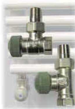
CONTROL VALVES A control valve allows you to control the temperature of the individual radiator.