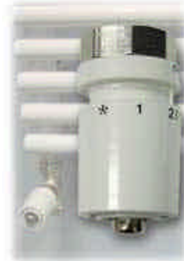
THERMOSTATIC CONTROL By adding the thermostatic sensor to the control valve, the temperature is maintained automatically rather than manually.