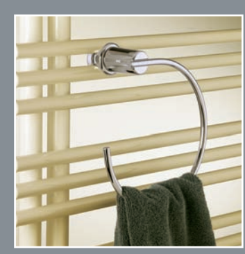
Towel Ring Available in chrome